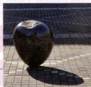
「Seed of Wonder」