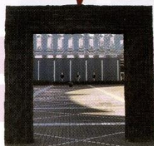
「Gate for Curiosity」