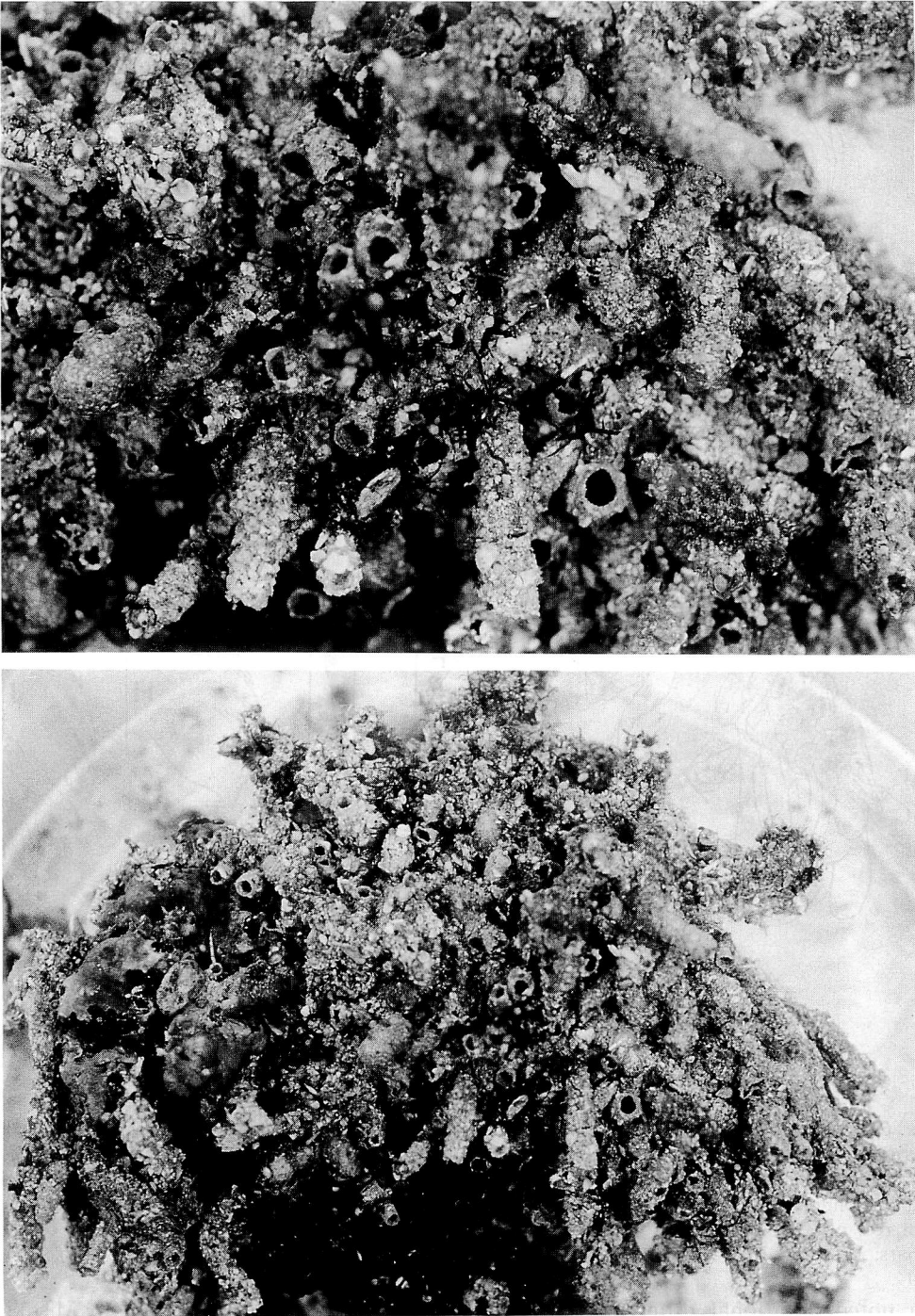
Fig. 2. Colony of Chaetopterus longipes Crossland, showing whole colony (lower) and close up (upper) views. Length of colony in lower photo is about 20 cm.