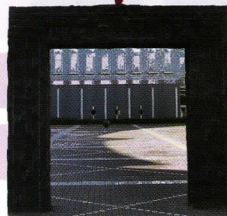
「Gate for Curiosity」