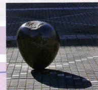
「Seed of Wonder」